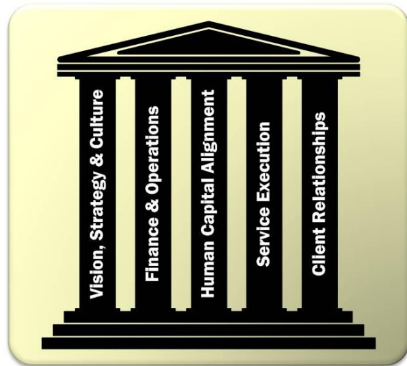
Figure 1: The Five Service Performance Pillars